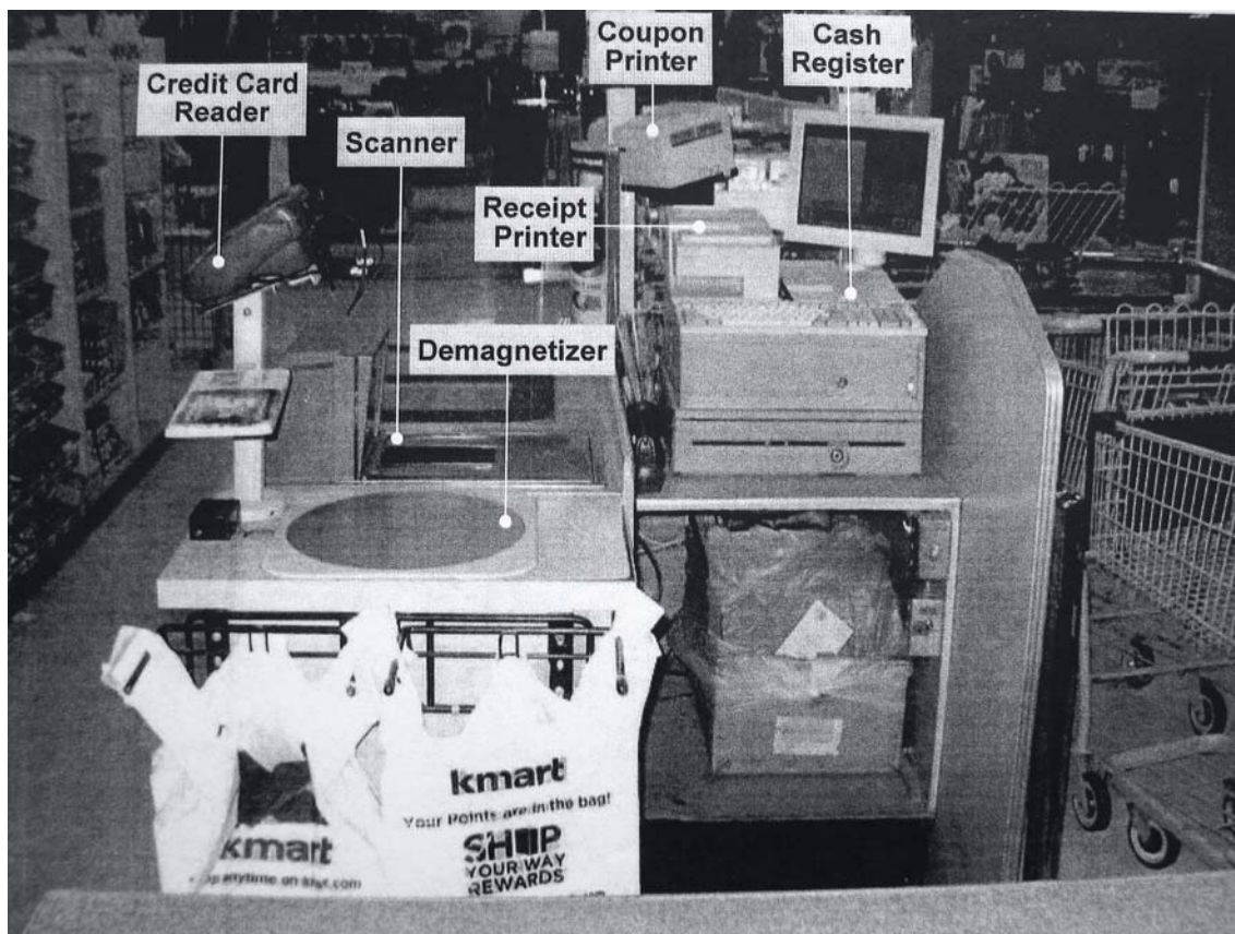
25 Photograph Looking Over Bagging Table Toward Main Counter and Cash Register (TX 216B)

1 12. Yet a third surface holds the cash register and affiliated items. This third feature 2 is another cabinet protruding horizontally from the main counter at a right angle in an L-shaped 3 configuration with the long side of the L being the main processing counter, and the cash register 4 cabinet being the short side. The cash register sits on top of an open cabinet, 36 inches above the 5 floor, that is, the bottom of the cash register is 36 inches above the floor. From the cashier's 6 perspective, the cash register cabinet is to the right of the checkout counter cabinet, and is flush 7 with the receiving side of the checkout counter cabinet (the side first encountered by a customer 8 entering the checkout lane). The following photograph (TX 216B) illustrates: